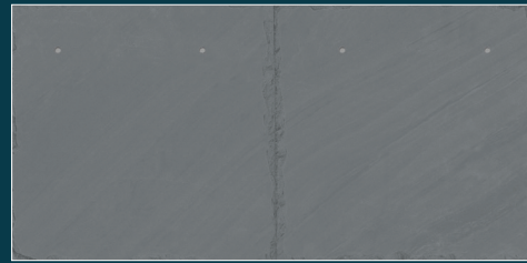
IMPRESSIONIST GREY SLATE PR42