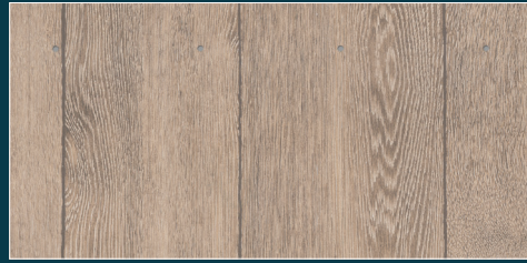
NORDIC TIMBER PR40