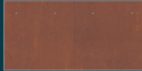
ADOBE CLAY PR44