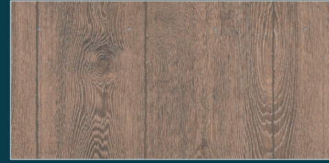
MYSTIC TIMBER PR41