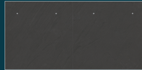
ONYX SLATE PR45