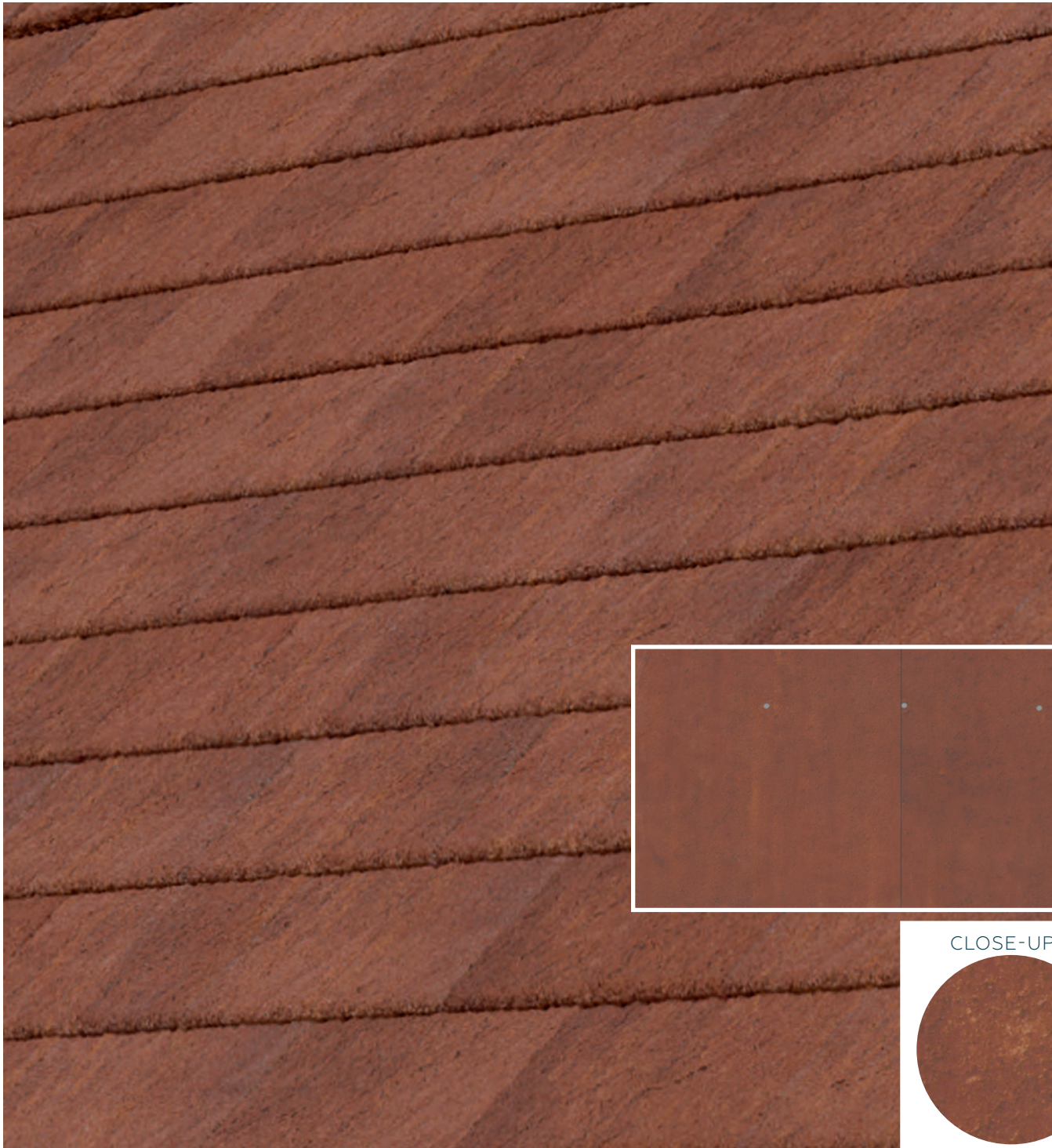
ADOBE CLAY PR44