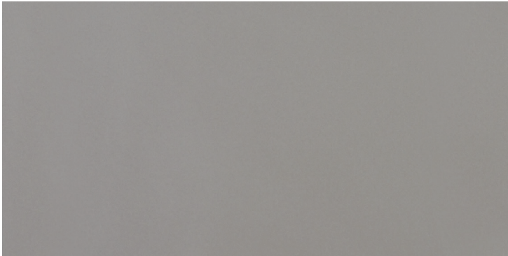
LEAD CC04 (1)