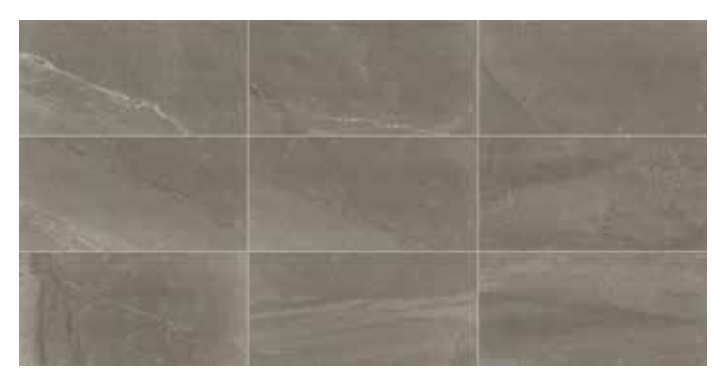
DARK GRAY ME09