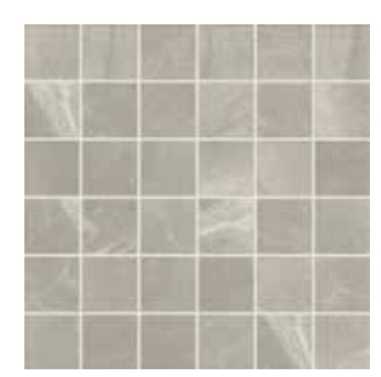
LIGHT GRAY ME08