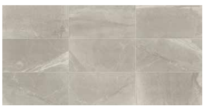
LIGHT GRAY ME08