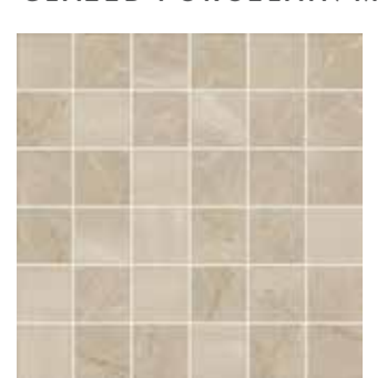
COOL BEIGE ME07