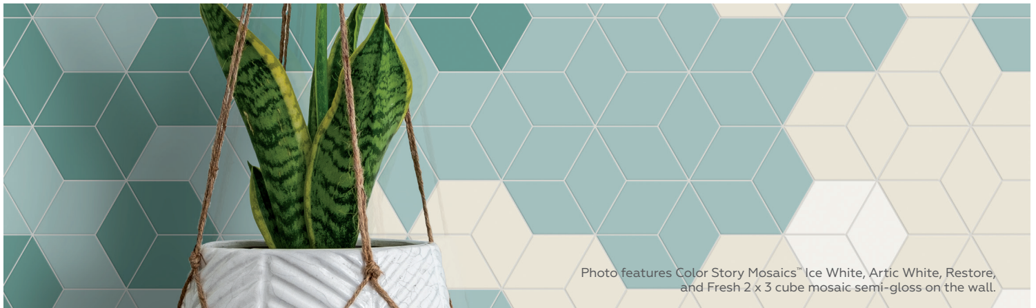
Photo features Color Story Mosaics™ Ice White, Artic White, Restore, and Fresh 2 x 3 cube mosaic semi-gloss on the wall.

For additional product information, please refer to the Sales Sheet at americanolean.com/product/Color-Story-Mosaic