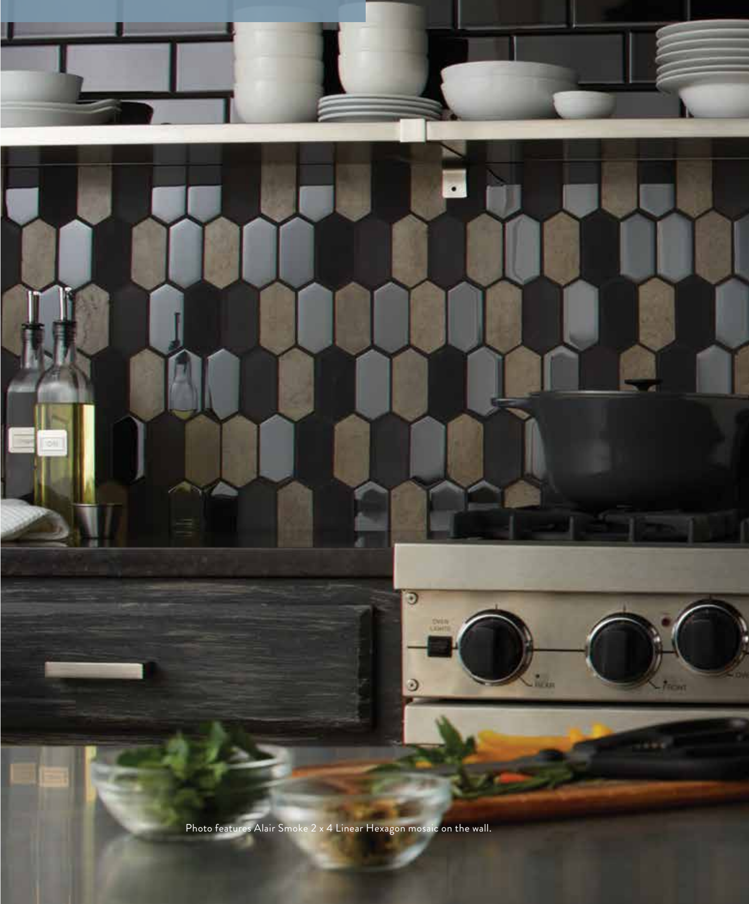
Photo features Alair Smoke 2 x 4 Linear Hexagon mosaic on the wall.