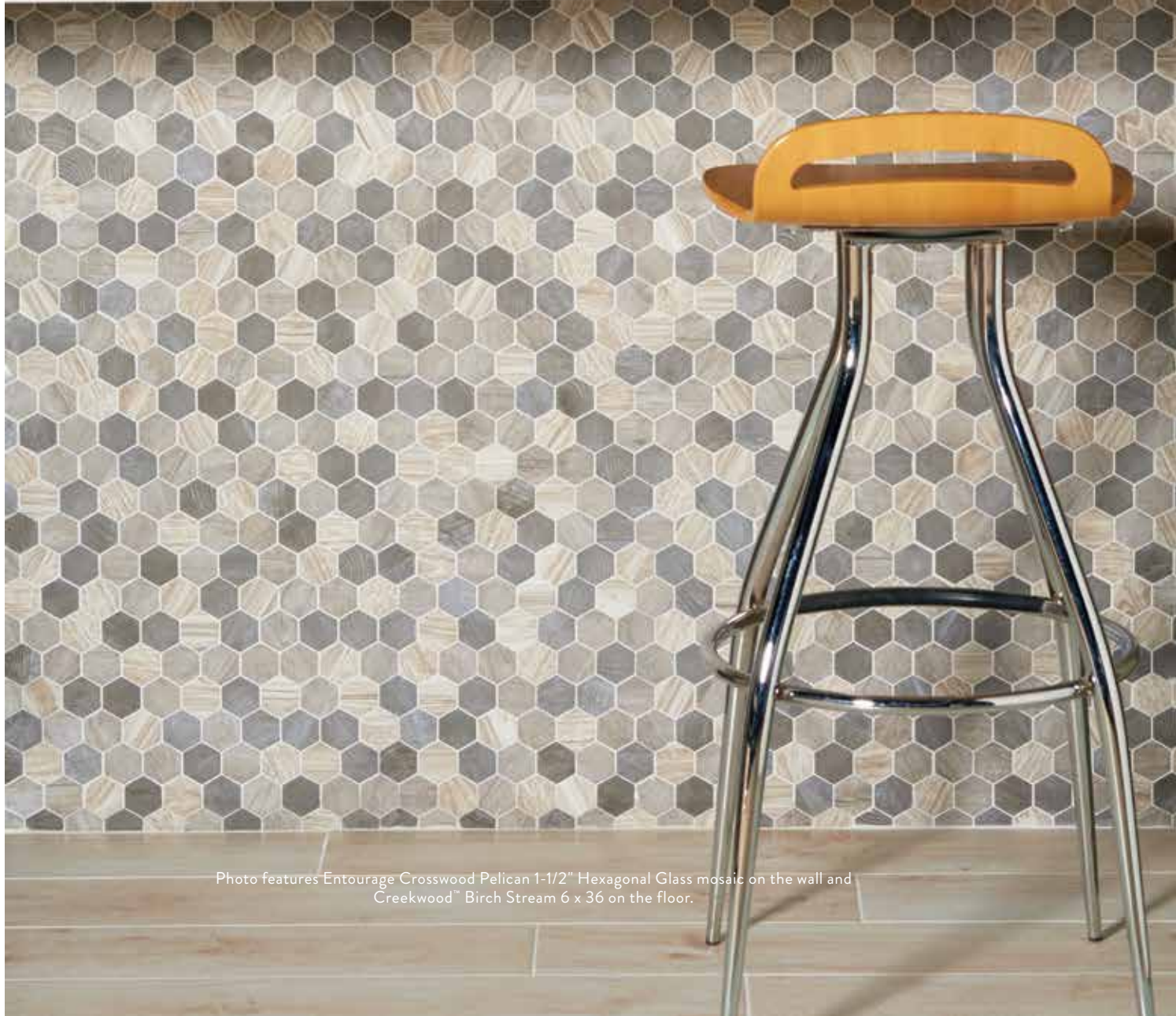
Photo features Entourage Crosswood Pelican 1-1/2" Hexagonal Glass mosaic on the wall and Creekwood™ Birch Stream 6 x 36 on the floor.