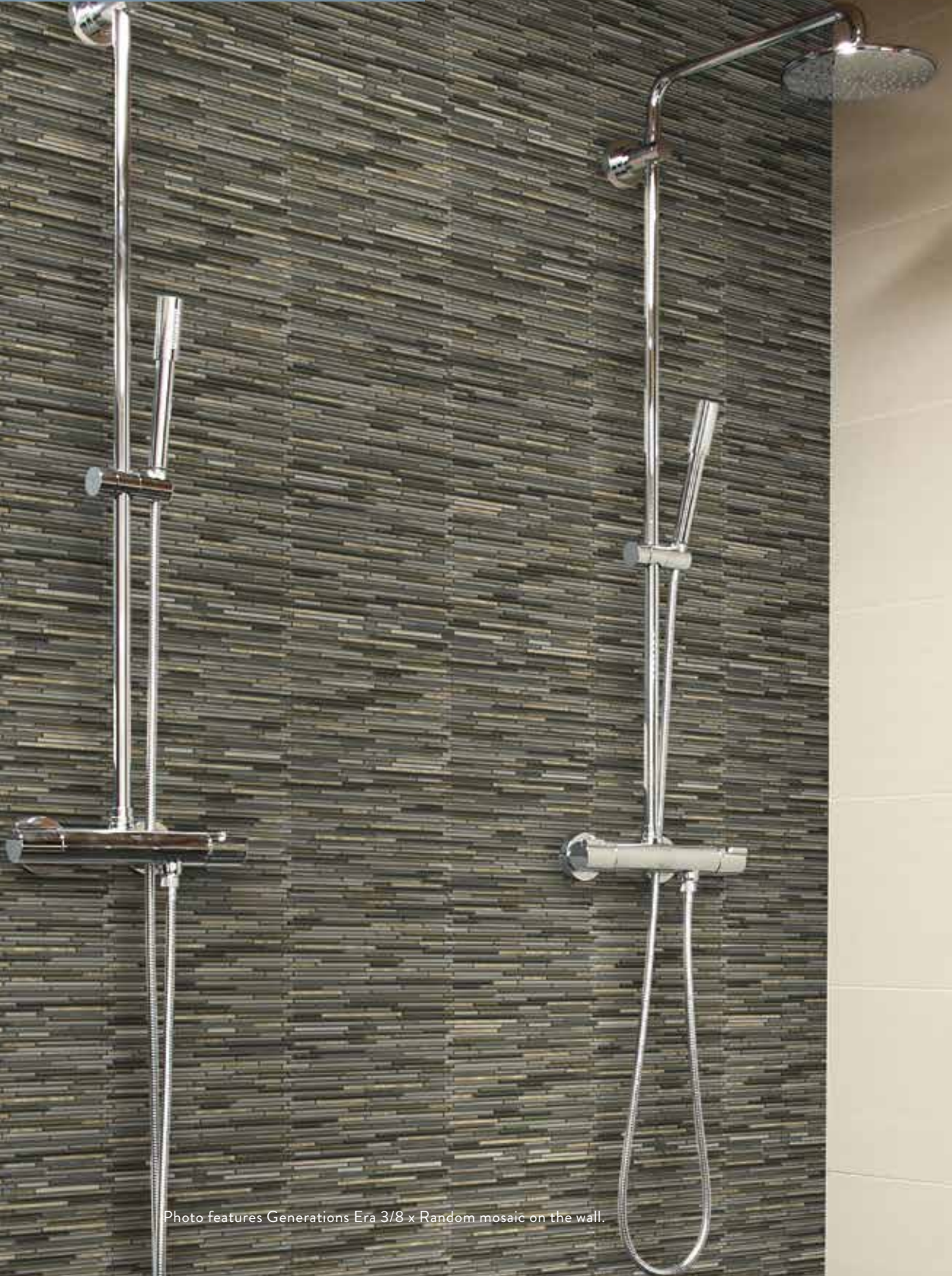
Photo features Generations Era 3/8 x Random mosaic on the wall.