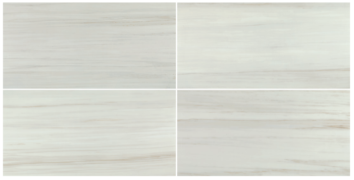
CARRARA WHITE IL10