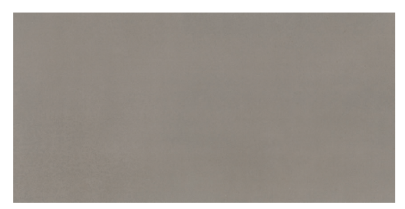
MEDIUM GRAY NE13