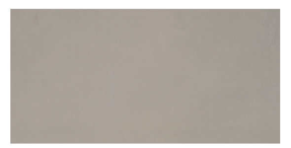
LIGHT GRAY NE12