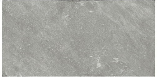
SUMMER MOSS ST35