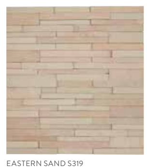
EASTERN SAND 5319 6" x 24" Stacked Stone Natural Cleft Ungauged