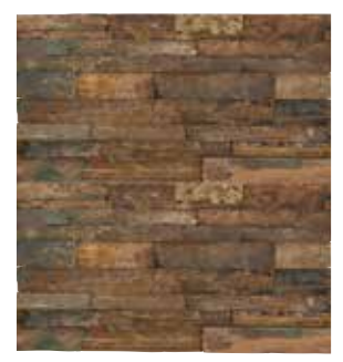
TIBETAN SLATE S317 6" x 24" Stacked Stone Natural Cleft Ungauged