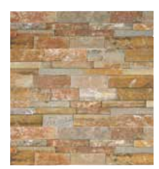
SHANGHAI RUST S349 6" x 24" Stacked Stone Natural Cleft Ungauged