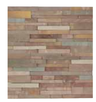
DYNASTY MOUNTAIN S318 6" x 24" Stacked Stone Natural Cleft Ungauged