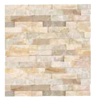
GOLDEN SUN S783 6" x 24" Stacked Stone Natural Cleft Ungauged