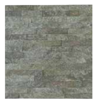
BEIJIN GREEN S282 6" x 24" Stacked Stone Natural Cleft Ungauged