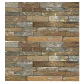
IMPERIAL FALLS S316 6" x 24" Stacked Stone Natural Cleft Ungauged