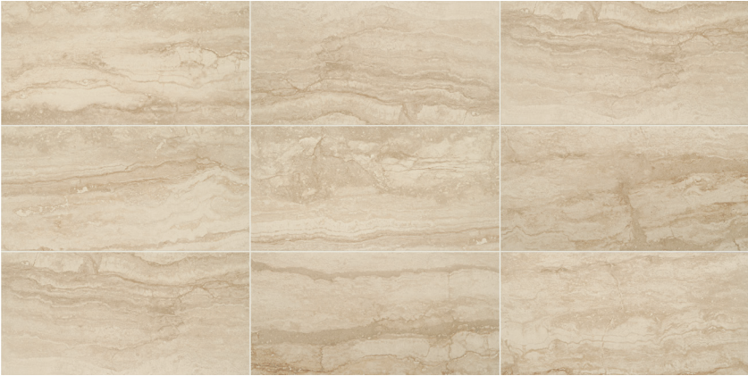
LIGHT NOCE VL07