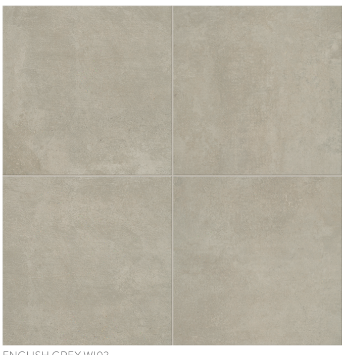
ENGLISH GREY WI03