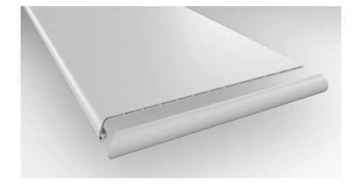
Full Round Stair Tread

Performance Accessories' exclusive 4-in-1 transition allows you to utilize a single transition for four different applications.