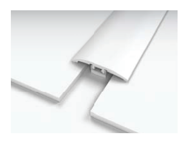
T-Molding Used to transition between

flooring of equal heights and in doorways.