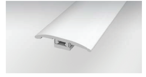
Slim Trim 4-in-1 Transition

Creates a transition to the edge of the step by overlapping the flooring on the back end. Can also be installed flush on floors with an overall thickness up to 4 mm.*