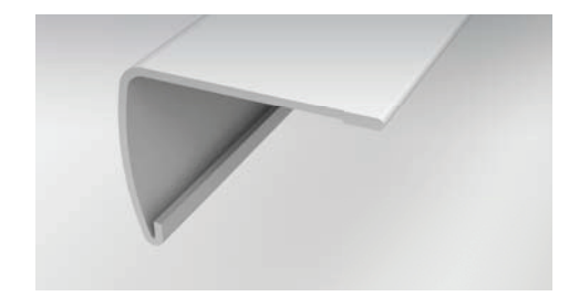
Extra Tall Stair Nose

Low profile end cap used to transition from flooring to carpet, masonry, sliding doors, and other exterior door jambs.