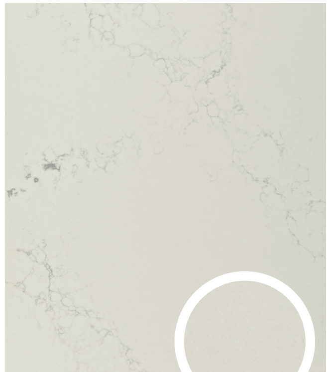
LIBERTY CALACATTA OQ44