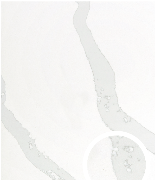
STATUARY UNITY OQ53