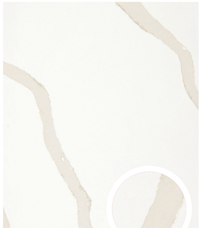
STATUARY GLORY OQ52