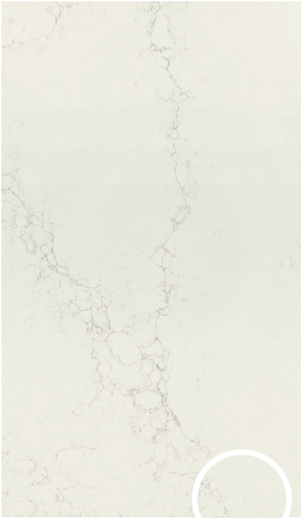
LIBERTY GOLD OQ45