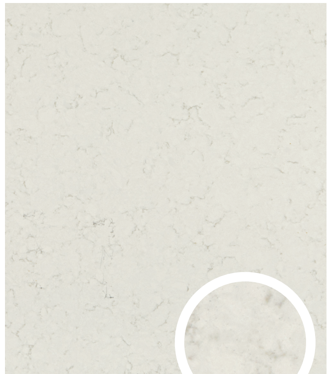
GOLDEN GATE OQ37