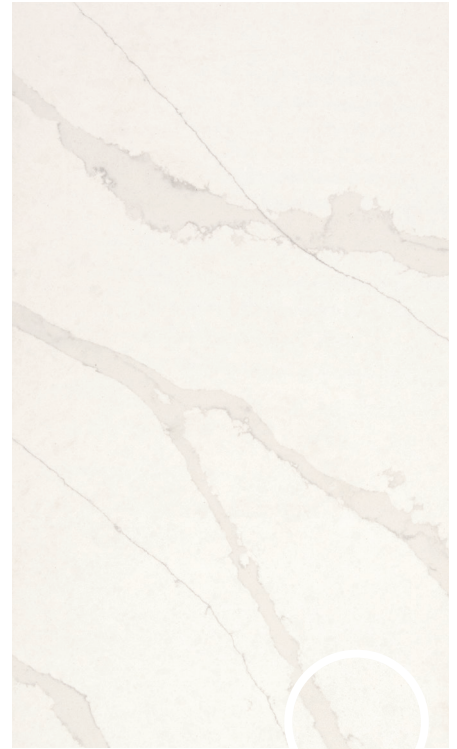
INDEPENDENCE CALACATTA OQ48