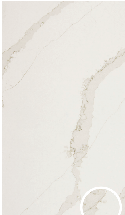
PATRIOTIC CALACATTA OQ47