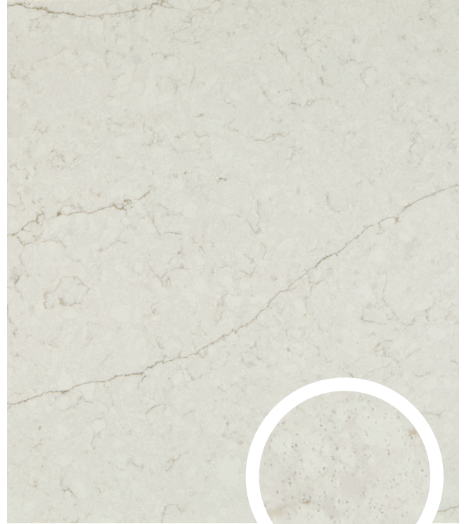
FREEDOM CALACATTA OQ42