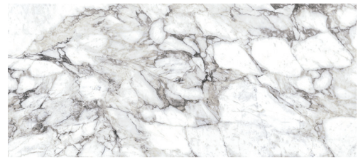
GYPSUM CALACATTA CM22