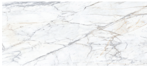
DIAMOND MINE CM12