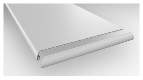
Full Round Stair Tread A vinyl stair tread with pre-attached stair nosing. Can be used on steps with or without nosing.