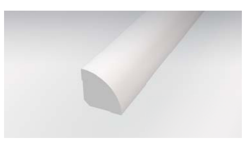
Quarter Round Conceals the expansion space between the wall and the flooring.