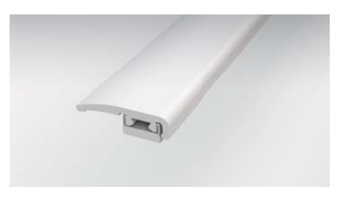
Slim Cap Low profile end cap used to transition from flooring to carpet, masonry, sliding doors, and other exterior door jambs.