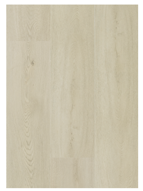
PICKET FENCE AB21