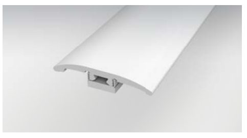
Slim Trim 4-in-1 Transition Performance Accessories' exclusive 4-in-1 transition allows you to utilize a single transition for four different applications.