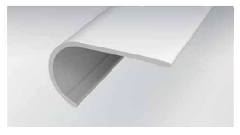
Round Stair Nose Creates a transition to the edge of the step by overlapping the flooring on the back end. Can also be installed flush on floors with an overall thickness up to 4 mm.*