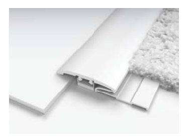
Carpet Transition Provides a smooth transition between your hard surface floor & carpet. A carpet tap down trim <u>must</u> be used & is sold at your local hardware store.