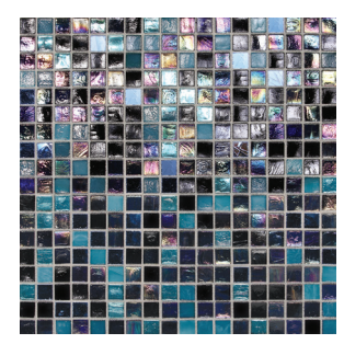
LAS VEGAS CL69**