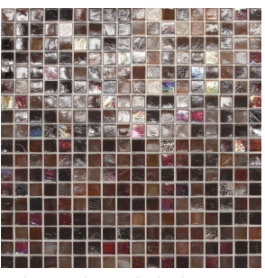
MONTE CARLO CL63*