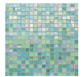
ST. THOMAS CL70**