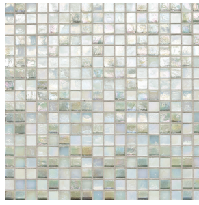
ST. MORITZ CL65*