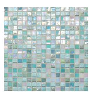
SOUTH BEACH CL71*