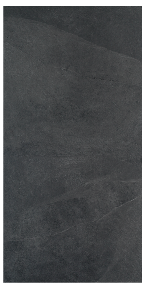
DARK GREY DL27