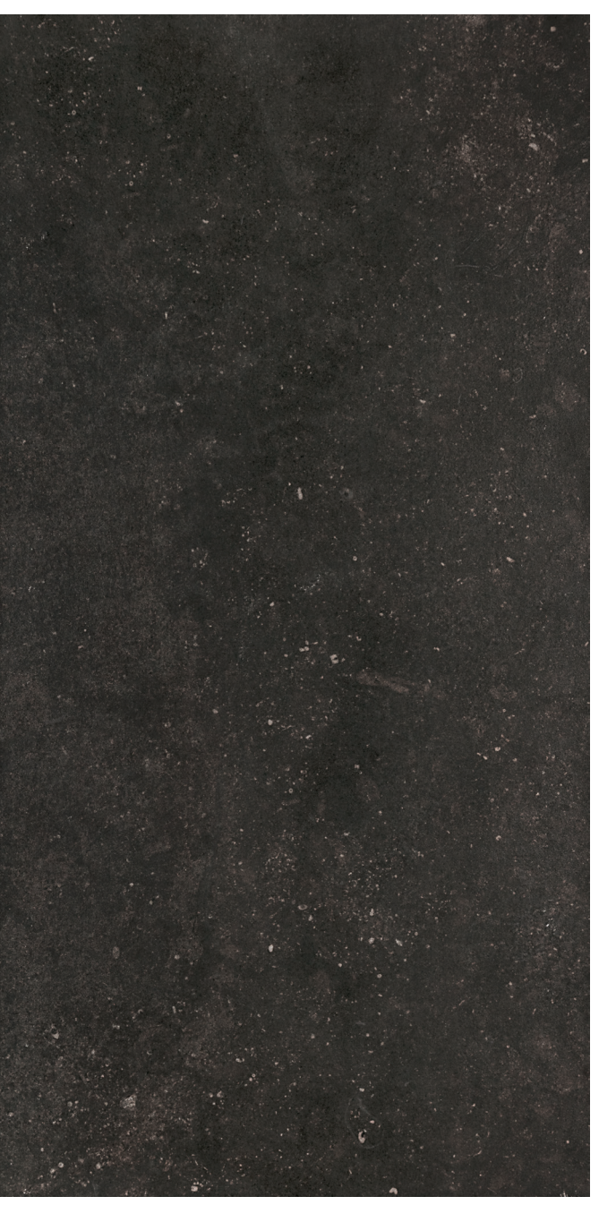
DARK GREY DP03