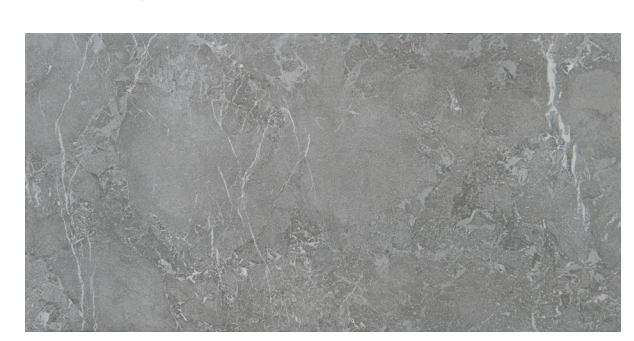
CLARITY EL62 TRANSCEND EL64