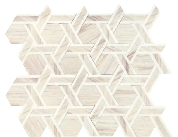
PIER WHITE BLEND DA46 Rotating Hexagon Mosaic – Honed Mosaic shown in 4 sheets