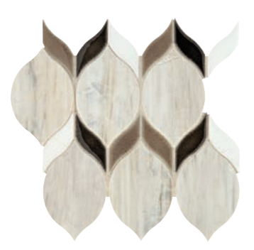
PIER WHITE BLEND DA49 Double Leaf Mosaic – Polished