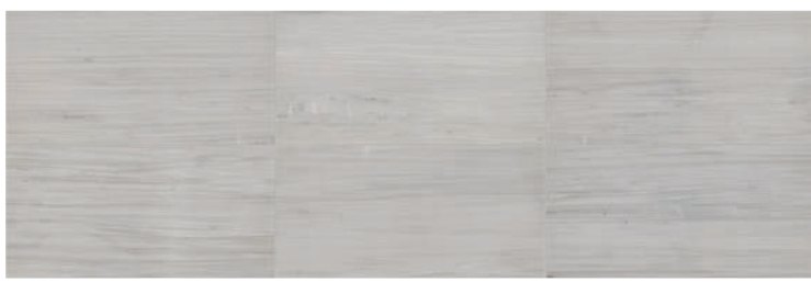
12" x 24" & 3" x 9" - HONED 12" x 24" - POLISHED