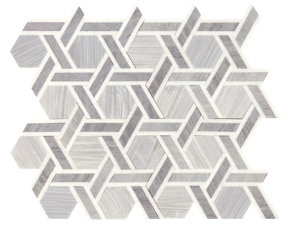
NAUTICAL GREY BLEND DA47 Rotating Hexagon Mosaic – Honed Mosaic shown in 4 sheets