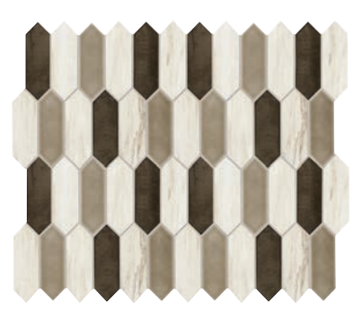
PIER WHITE BLEND DA43 Picket Mosaic – Honed