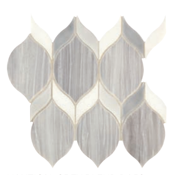
NAUTICAL GREY BLEND DA50 Double Leaf Mosaic – Polished