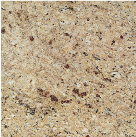
NEW VENETIAN GOLD G215 12" x 12" – Polished