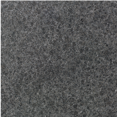
ABSOLUTE BLACK G771 12" x 24" & 12" x 12" – Flamed