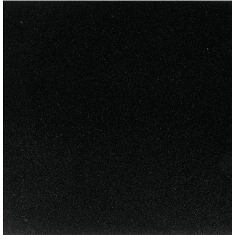
ABSOLUTE BLACK G771 24" x 24", 12" x 24", 18" x 18" & 12" x 12" – Polished 12" x 12" – Honed