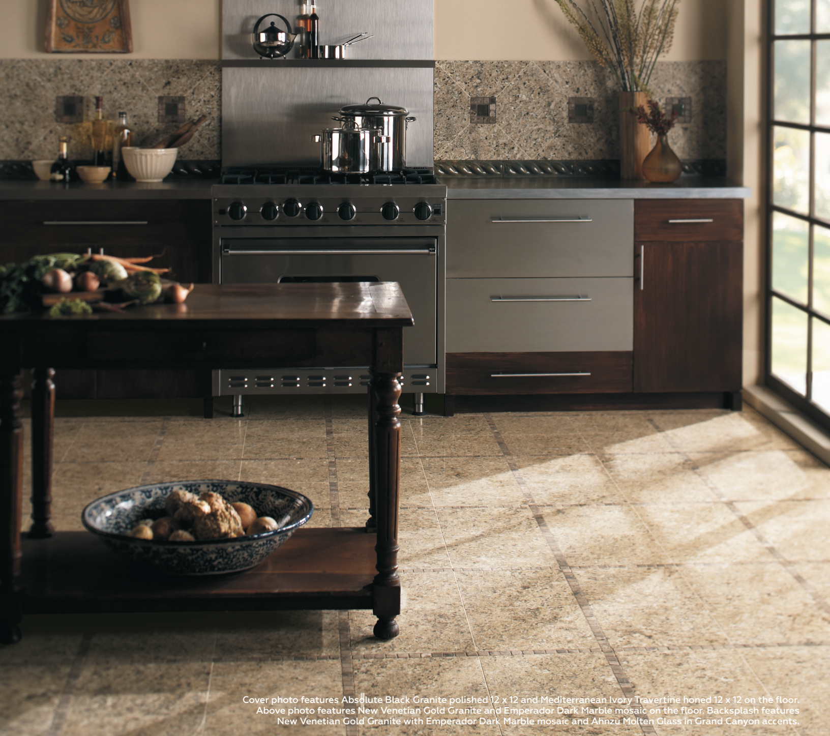
Cover photo features Absolute Black Granite polished 12 x 12 and Mediterranean Ivory Travertine honed 12 x 12 on the floor. Above photo features New Venetian Gold Granite and Emperor Dark Marble mosaic on the floor. Backsplash features New Venetian Gold Granite with Emperor Dark Marble mosaic and Ahnzü Molten Glass in Grand Canyon accents.