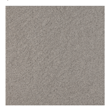
COMPOSURE HM23 (1)