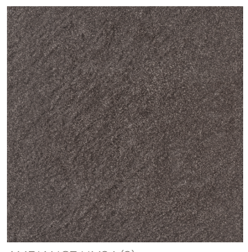
AMBIANCE HM24 (2)