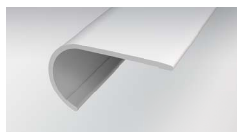
Round Stair Nose

Creates a transition to the edge of the step by overlapping the flooring on the back end. Can also be installed flush on floors with an overall thickness up to 4 mm.*