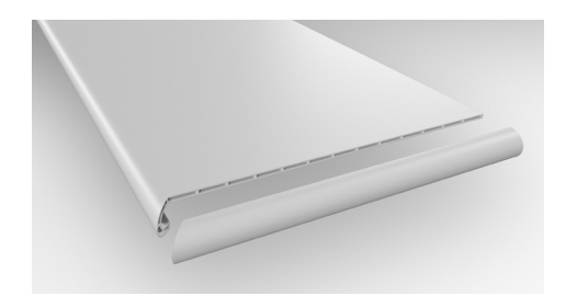
Full Round Stair Tread A vinyl stair tread with pre-attached stair nosing. Can be used on steps with or without nosing.

Slim Trim 4-in-1 Transition Performance Accessories' exclusive 4-in-1 transition allows you to utilize a single transition for four different applications.