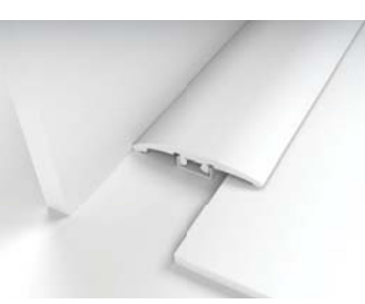
End Molding Finishing up to a threshold, sliding door, etc.