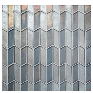
SERENATA BLEND IL93