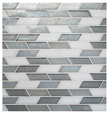
WHISPER BLEND IL99