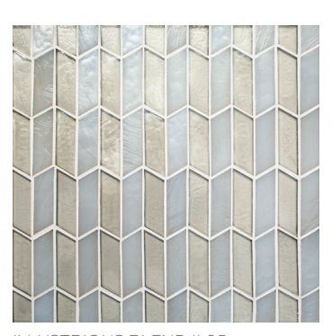
ILLUSTRIOUS BLEND IL95