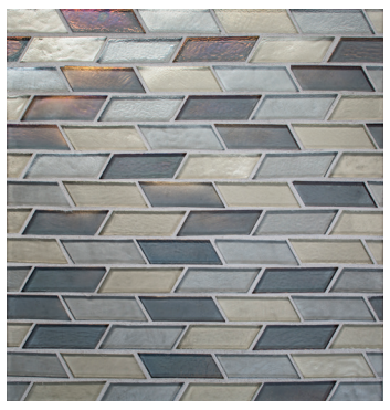
RADIANCE BLEND IL97