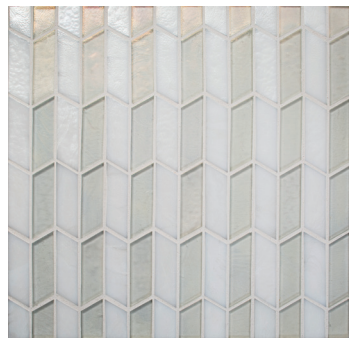
WISP BLEND IL94