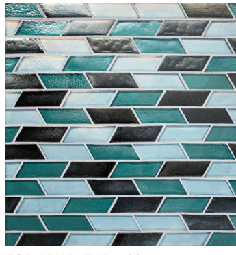
TOPIARY BLEND IL98