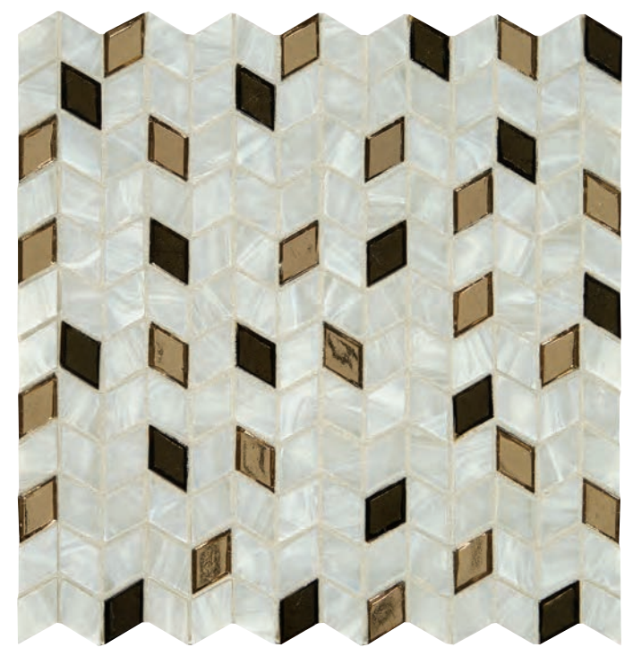
GOLD RUSH IR03