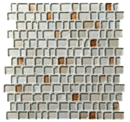
SPARKLING SAND JT01