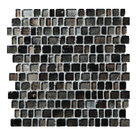
SEA GLASS SHIMMER JT04