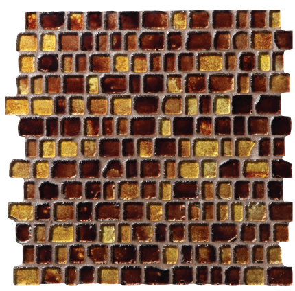
AMBER WAVE JT05