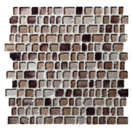
BEACH PEBBLE JT02