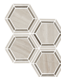
CHENILLE WHITE L191 6" Hexagon Mosaic Honed