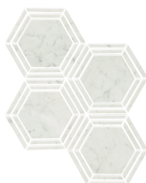
CARRARA WHITE M701 6" Hexagon Mosaic Polished