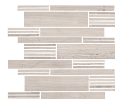
CHENILLE WHITE L191 Random Linear Mosaic* Polished, Honed & Scraped

* Mosaic can be cut into thirds to create interlocking decorative border