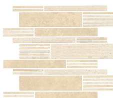
TORREON T711 Random Linear Mosaic* Polished, Honed & Scraped