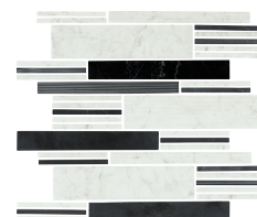
BLACK/ WHITE BLEND M753 Multi Random Linear Mosaic* Polished, Honed & Scraped