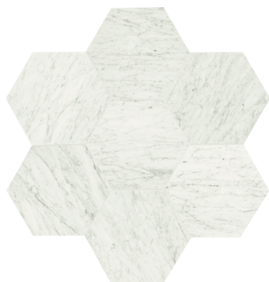
CARRARA WHITE M701 18" x 20-3/4" Hexagon – Polished