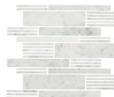
CARRARA WHITE M701 Random Linear Mosaic* Polished, Honed & Scraped