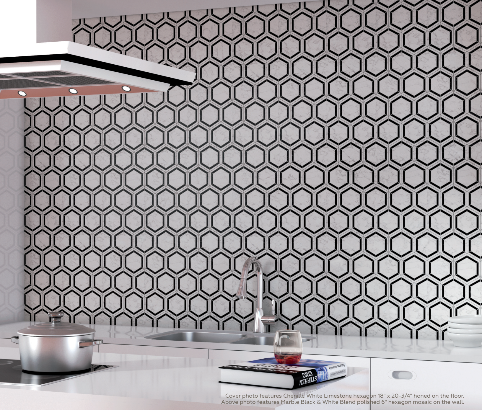
Cover photo features Chenille White Limestone hexagon 18" x 20-3/4" honed on the floor. Above photo features Marble Black & White Blend polished 6" hexagon mosaic on the wall.