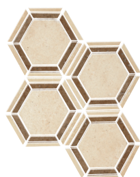
TORREON T711 6" Hexagon Mosaic Honed