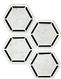
BLACK/WHITE BLEND M753 6" Hexagon Mosaic Polished