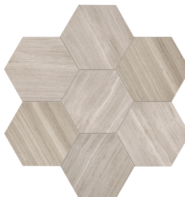
CHENILLE WHITE L191 18" x 20-3/4" Hexagon – Honed