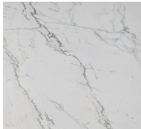
CALACATTA QUARTZITE Q721 3/4" (2cm) & 1-1/4" (3cm) - Polished