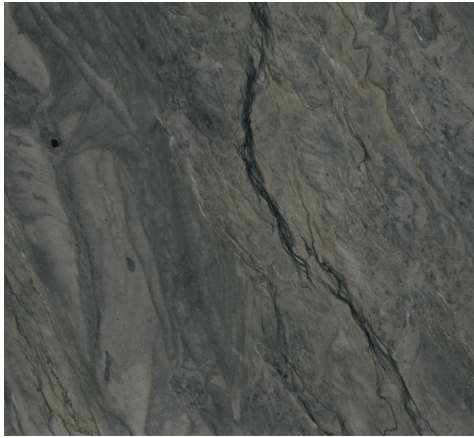
MORENO Q021 3/4" (2cm) & 1-1/4" (3cm) – Polished