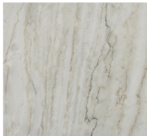
PEGASUS WHITE Q767 3/4" (2cm) & 1-1/4" (3cm) - Polished