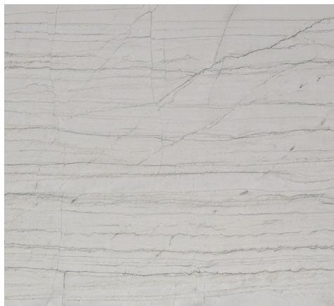
WHITE MACAUBAS Q718 3/4" (2cm) & 1-1/4" (3cm) - Polished