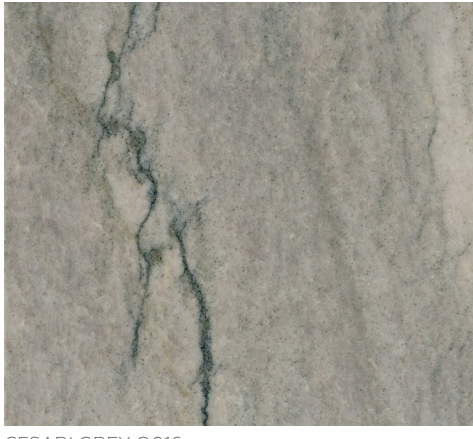
CESARI GREY Q016 3/4" (2cm) & 1-1/4" (3cm) – Polished