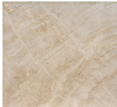
CRYSTALLIZE Q705 3/4" (2cm) & 1-1/4" (3cm) - Polished, Honed & Leather