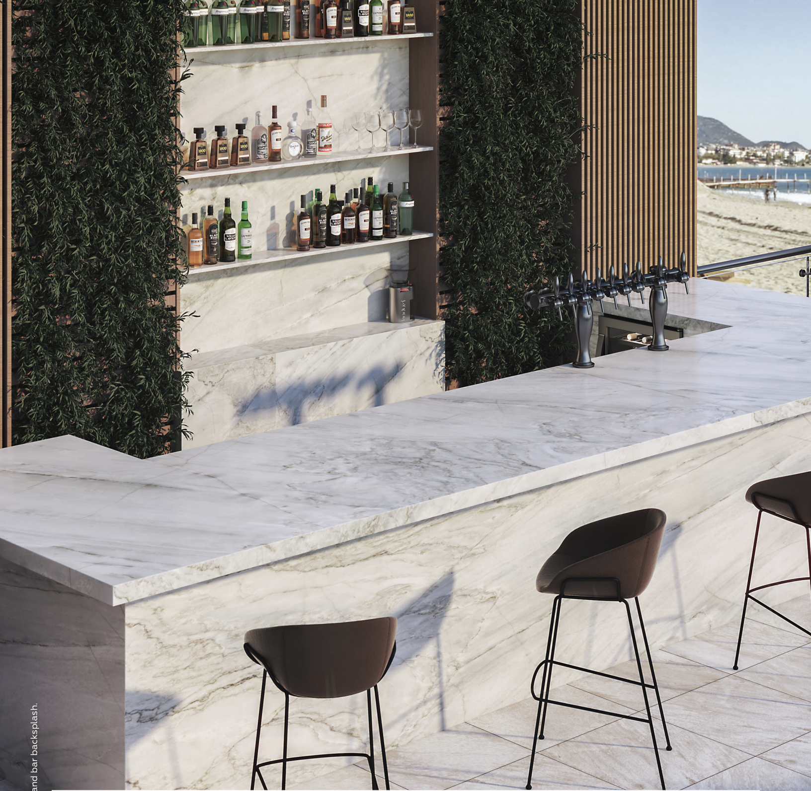
Photo features White Pearl on the countertop and bar backsplash.