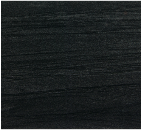
TARTARUS Q006 3/4" (2cm) & 1-1/4" (3cm) – Polished & Leather