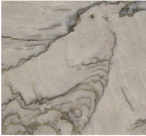
CHACRA Q020 3/4" (2cm) & 1-1/4" (3cm) – Polished