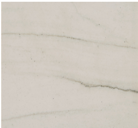
MONT LUCIA Q737 3/4" (2cm) & 1-1/4" (3cm) - Polished