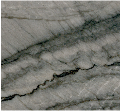
MERCURY Q103 3/4" (2cm) & 1-1/4" (3cm) – Polished