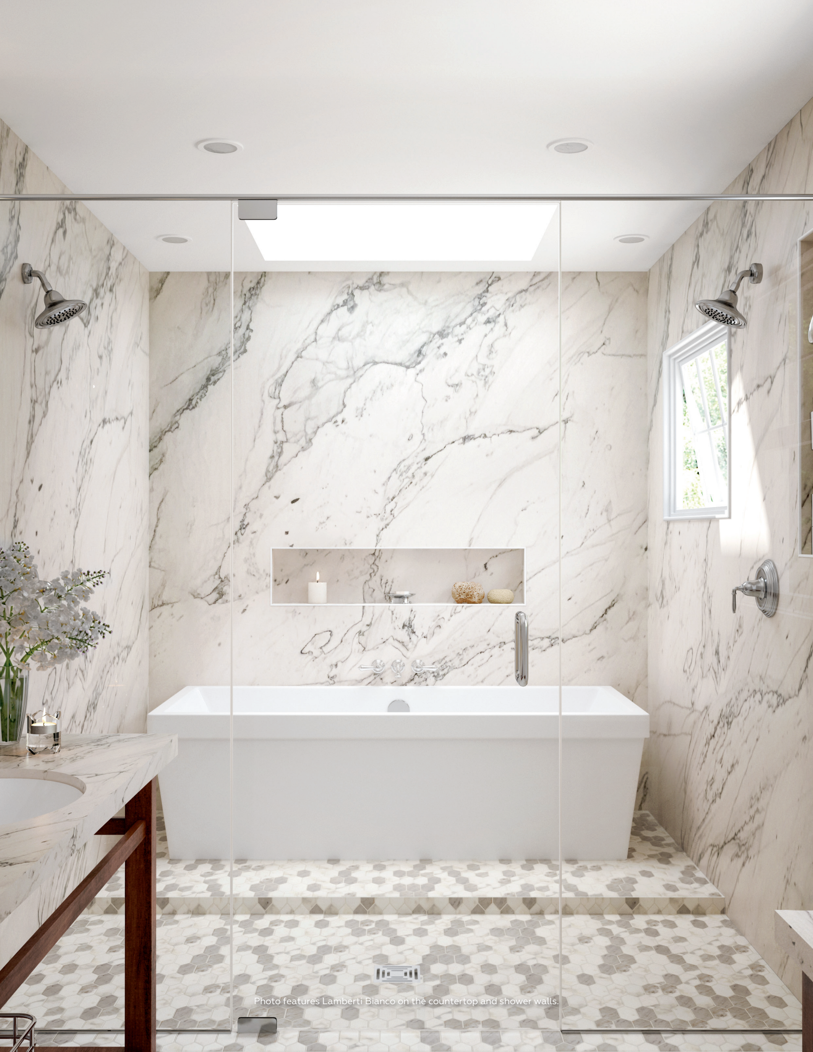
Photo features Lamberti Bianco on the countertop and shower walls.