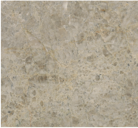
SAVOIE Q019 3/4" (2cm) & 1-1/4" (3cm) – Polished