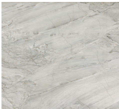
NEW! WHITE PEARL Q771 3/4" (2cm) & 1-1/4" (3cm) - Polished