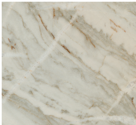
TAHITIAN CREAM Q101 3/4" (2cm) & 1-1/4" (3cm) - Polished