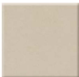
URBAN PUTTY 6561 (1)