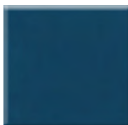
GALAXY 6538 (2)