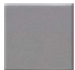
SUEDE GRAY 6453 (1)