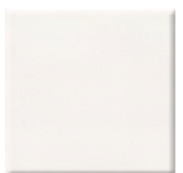
ARCTIC WHITE 6470 (1)