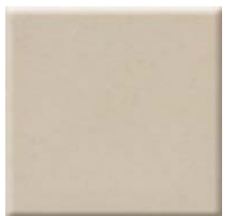
URBAN PUTTY 6461 (1)