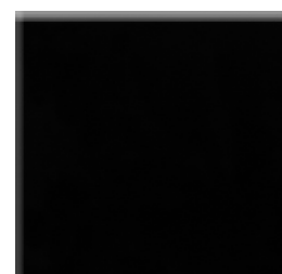
BLACK 6521 (1)