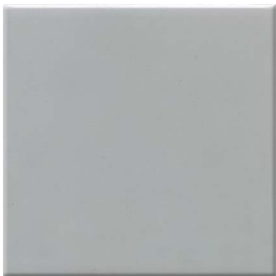
DESERT GRAY 6464 (1)