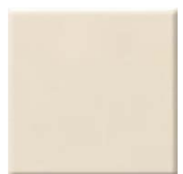
ALMOND 6465 (1)