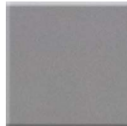
SUEDE GRAY 6553 (1)