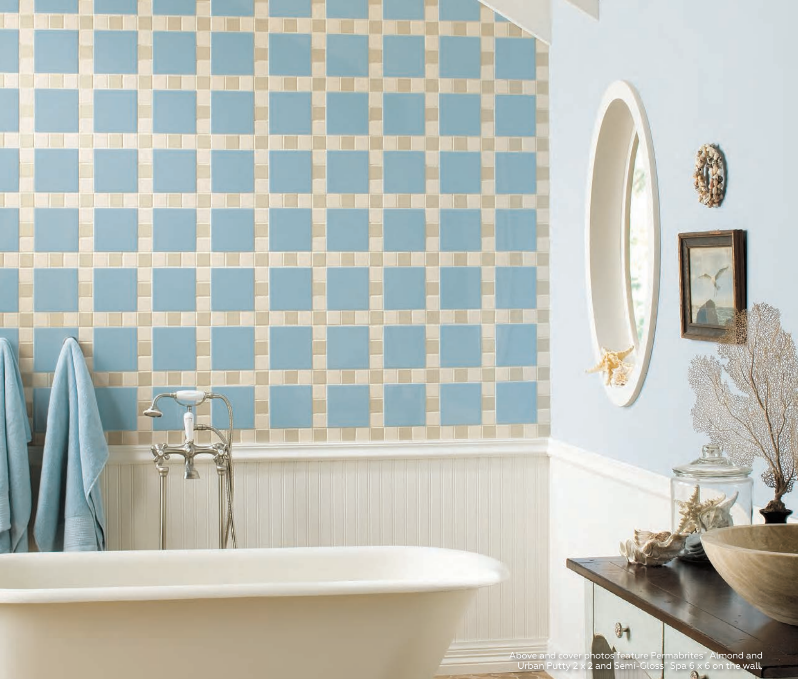
Above and cover photos feature Permabrites™ Almond and Urban Putty 2 x 2 and Semi-Gloss™ Spa 6 x 6 on the wall.