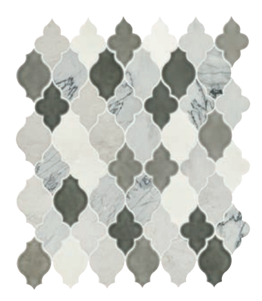
CIRRUS STORM BLEND DA41 Arabesque Mosaic – Honed