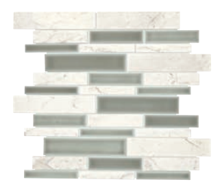
STRATUS WHITE BLEND DA34 Linear Random Mosaic – Polished