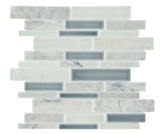
CIRRUS STORM BLEND DA35 Linear Random Mosaic – Polished