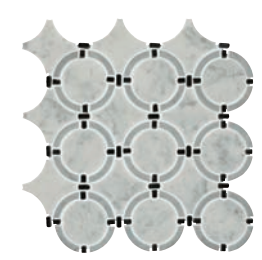
CIRRUS STORM BLEND DA38 Linked Ring Mosaic – Honed