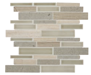
CUMULUS GREY BLEND DA36 Linear Random Mosaic – Polished