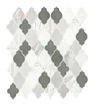
STRATUS WHITE BLEND DA40 Arabesque Mosaic – Honed