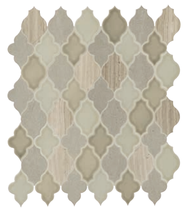
CUMULUS GREY BLEND DA42 Arabesque Mosaic – Polished