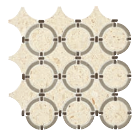
CUMULUS GREY BLEND DA39 Linked Ring Mosaic – Honed