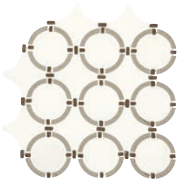
STRATUS WHITE BLEND DA37 Linked Ring Mosaic – Honed