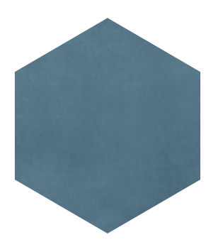
KEEPSAKE BLUE SB34