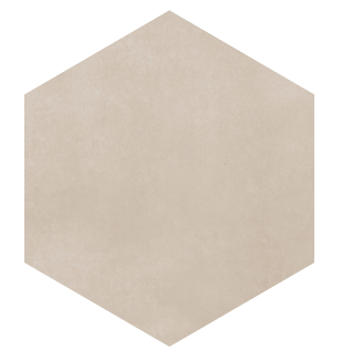
CHERISHED GREIGE SB33