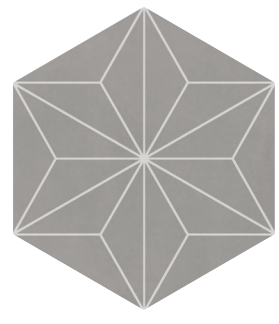
MEMORY GREY ASANOHA SB38