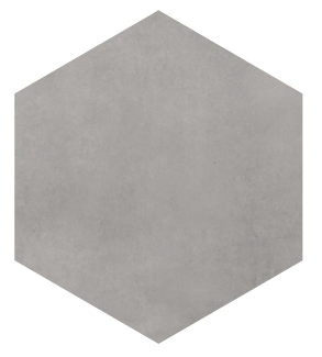
MEMORY GREY SB32