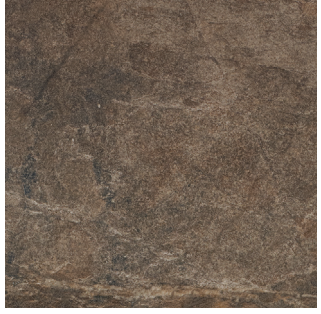
MULTI BROWN SA08*