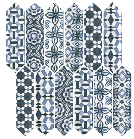
CAMEO BLUE MIX SC71 (12 unique designs)*