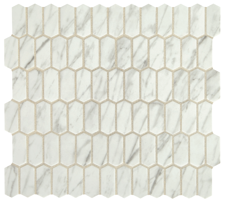
VENETIAN WHITE SE70