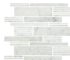
CARRARA WHITE M701 Random Linear Mosaic* Polished, Honed & Scraped