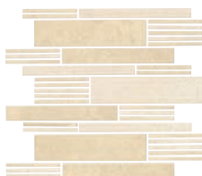
TORREON T711 Random Linear Mosaic* Polished, Honed & Scraped