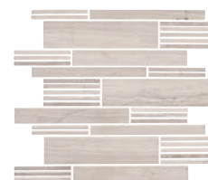
CHENILLE WHITE L191 Random Linear Mosaic* Polished, Honed & Scraped

* Mosaic can be cut into thirds to create interlocking decorative border