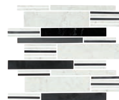
BLACK/ WHITE BLEND M753 Multi Random Linear Mosaic* Polished, Honed & Scraped