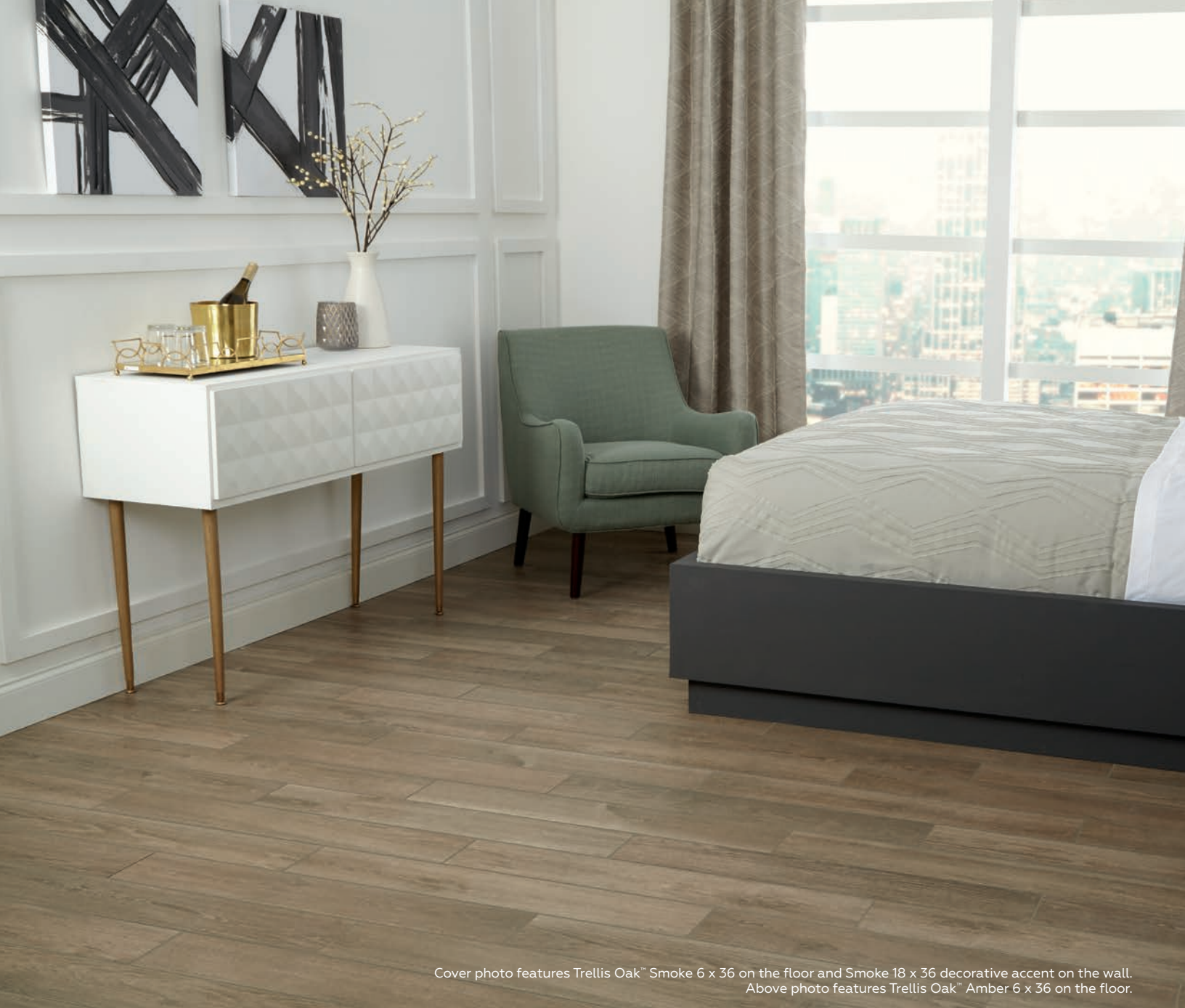
Cover photo features Trellis Oak™ Smoke 6 x 36 on the floor and Smoke 18 x 36 decorative accent on the wall. Above photo features Trellis Oak™ Amber 6 x 36 on the floor.