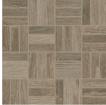
NATURAL ASH TR21