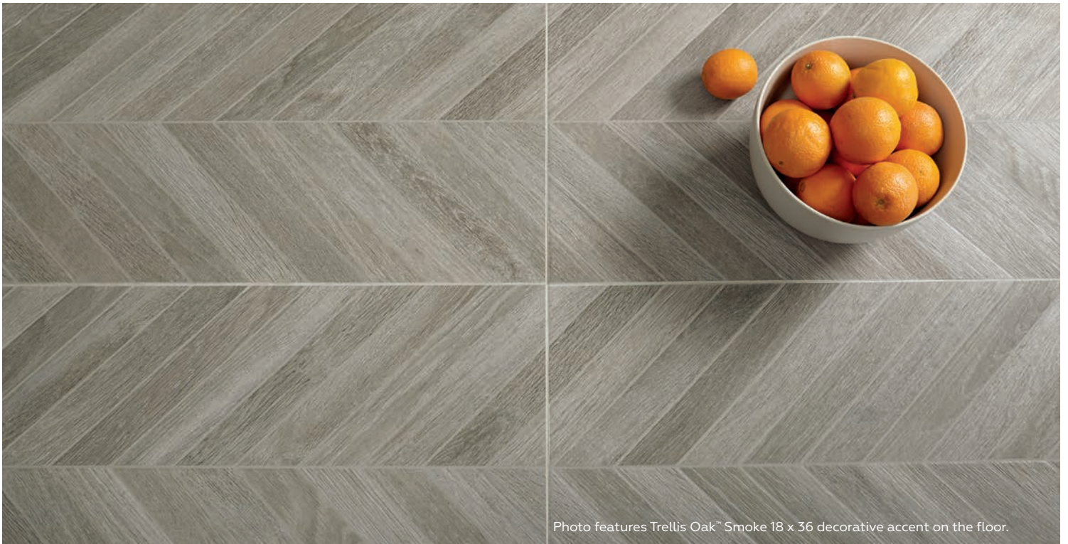
Photo features Trellis Oak™ Smoke 18 x 36 decorative accent on the floor.