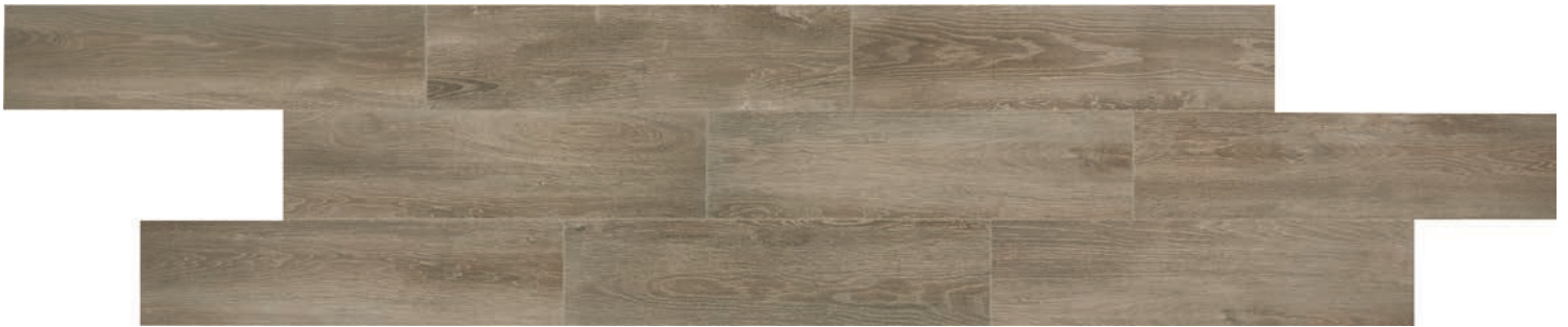
NATURAL ASH TR21