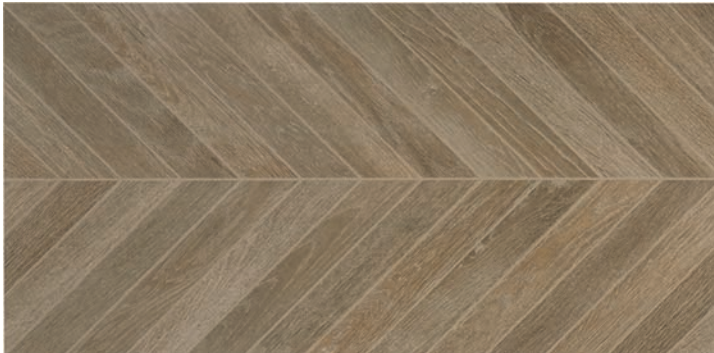
BROWN BLEND TR24