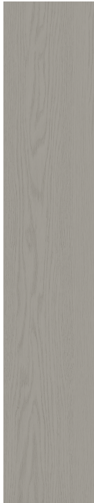
TAUPE UW13 (1)