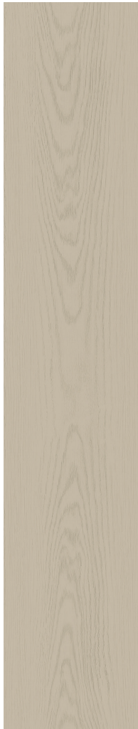
BEIGE UW11 (1)