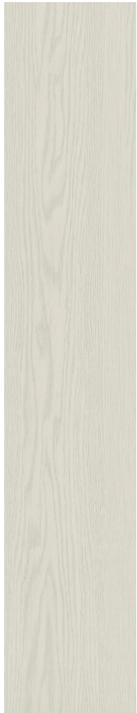
WHITE UW10 (2)