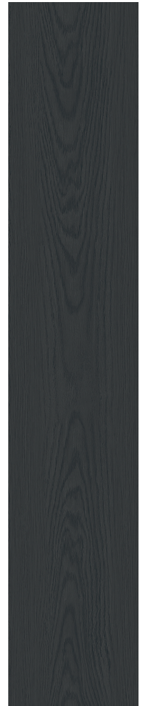
BLACK UW16 (1)

(1) and (2) indicate Price Groups, (1) being the least expensive.