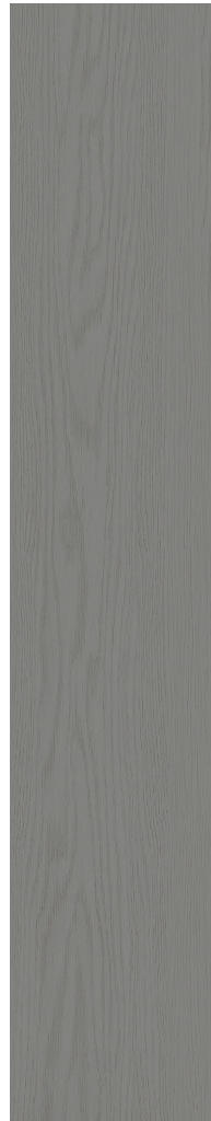
MEDIUM GREY UW14 (1)