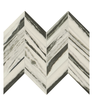
STRIA BRAVURA VR15