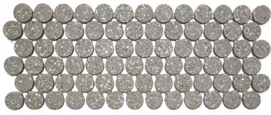
PENNY ROUND N215 SPECKLED GRAY 1" Penny Round N215 DID 21045 Speckled Gray