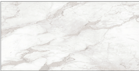
CALACATTA CM04 MATTE

Please note: Image above displays the graphic design for the custom tile detailed in this document. Samples of actual material are available upon request.