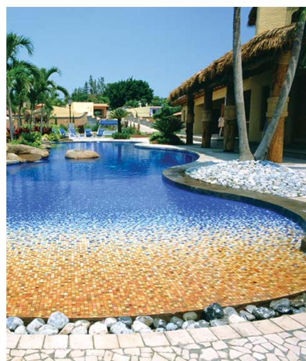
Per the TCNA Handbook, any submerged glass mosaics must be face-mounted.