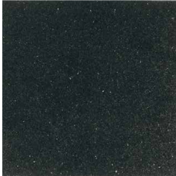
GALAXY BLACK G772 12" x 24", 18" x 18" & 12" x 12" – Polished