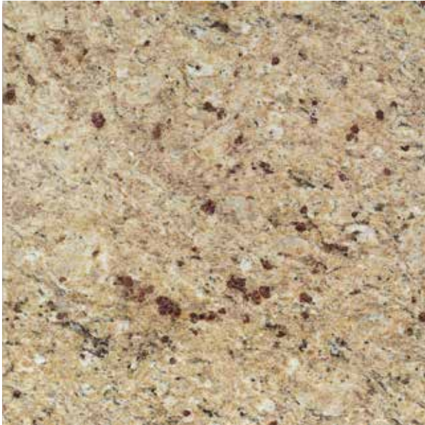
NEW VENETIAN GOLD G215 12" x 12" – Polished