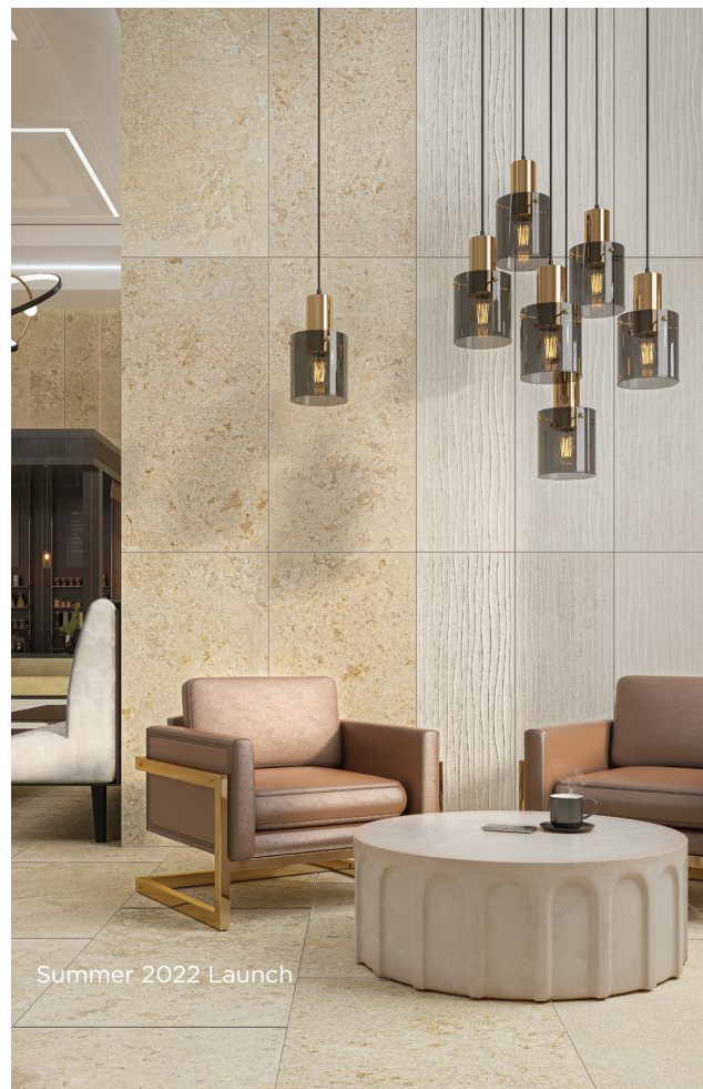
Summer 2022 Launch