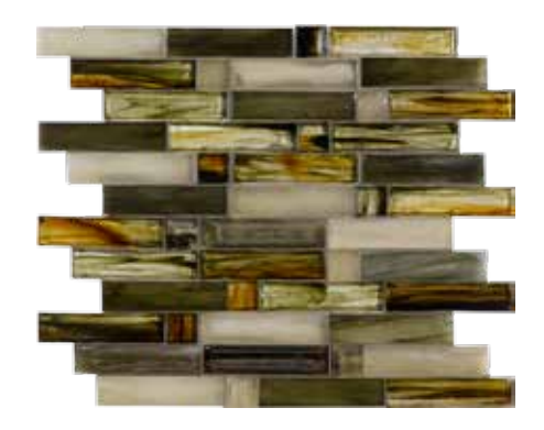
ULMY Eagle Beach 12½"x13"