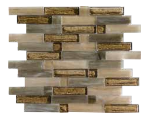
ULN2 Shoal Bay 121/2"x13"