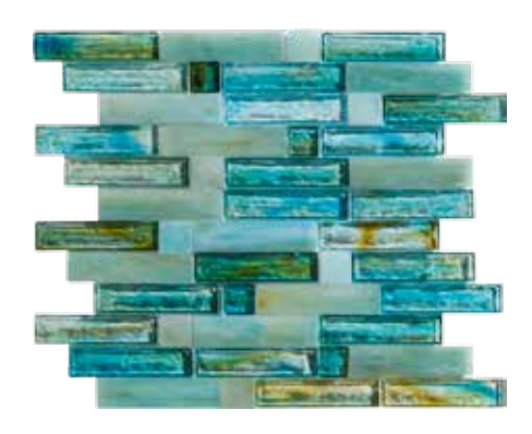
ULMW Blue Beach 12½"x13"