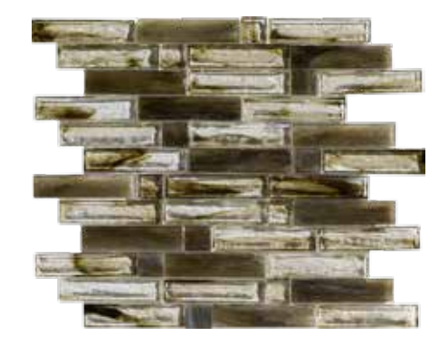
ULMV Baby Beach 12½"x13"