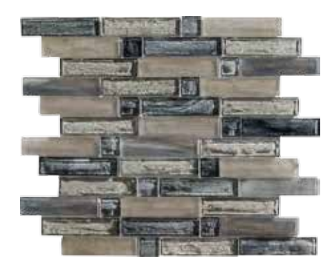
ULMZ Grace Beach 121/2"x13"