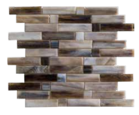
ULMX Crane Beach 121/2"x13"