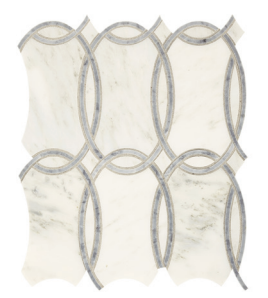
CT54 Trellis White and Gray 14 x 12 Sheet