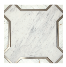
CT60 Nouveau White and Titanium 11 x 11 Sheet