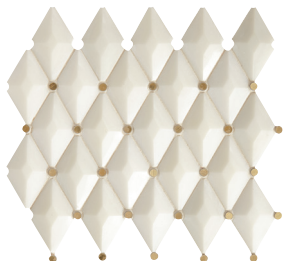
CT58 Harlequin White and Brass 13 x 12 Sheet