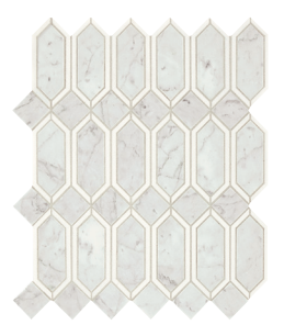
CT56 Linear Hex White and Gray 15 x 13 Sheet