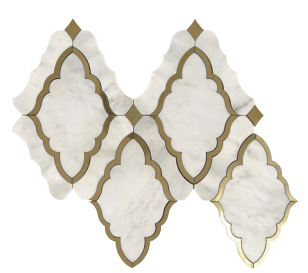
CT59 Baroque White and Brass 16 x 14 Sheet