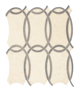
CT55 Trellis Beige and Gray 14 x 12 Sheet