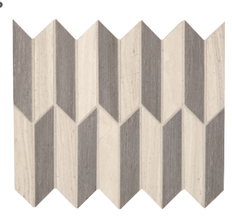
CT63 Neo Arrow Gray and Fawn 11 x 12 Sheet