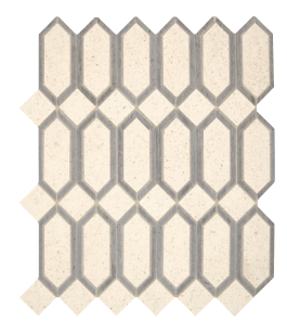
CT57 Linear Hex Beige and Gray 15 x 13 Sheet