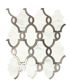
CT61 Basilica White and Steel 15 x 13 Sheet