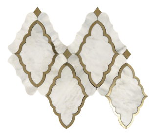
CT59 Baroque White and Brass 16 x 14 Sheet