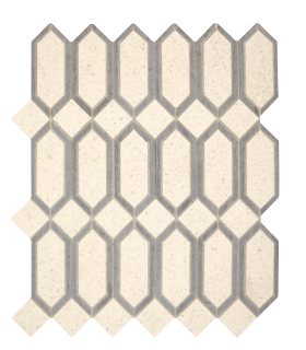
CT57 Linear Hex Beige and Gray 15 x 13 Sheet