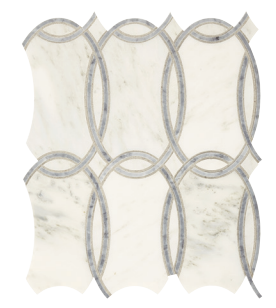
CT54 Trellis White and Gray 14 x 12 Sheet