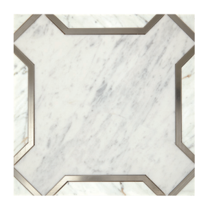
CT60 Nouveau White and Titanium 11 x 11 Sheet