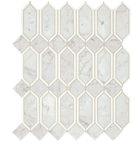
CT56 Linear Hex White and Gray 15 x 13 Sheet