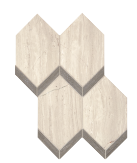
CT69 Elongated Hex Gray and Fawn 13 x 17 Sheet