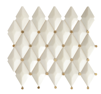
CT58 Harlequin White and Brass 13 x 12 Sheet