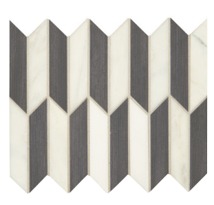
CT62 Neo Arrow White and Midnight Gray 11 x 12 Sheet