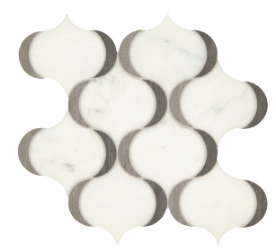
CT66 Modern Arabesque White and Midnight Gray 13 x 14 Sheet