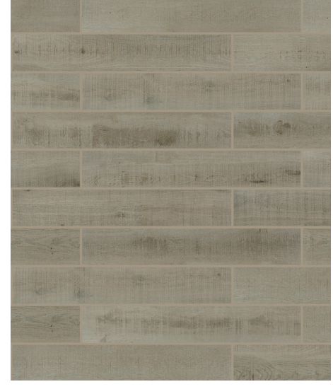
CR41 La Petit Greige