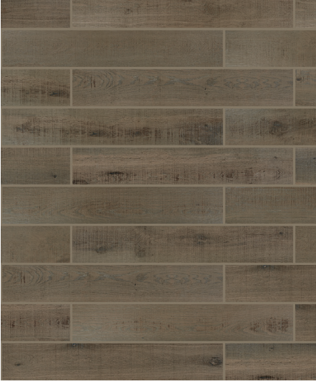
CR44 Woodland Chalet