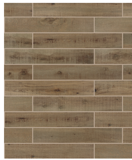
CR43 Rustic Lodge