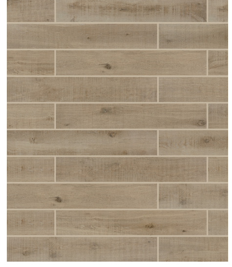
CR40 Hickory Grove